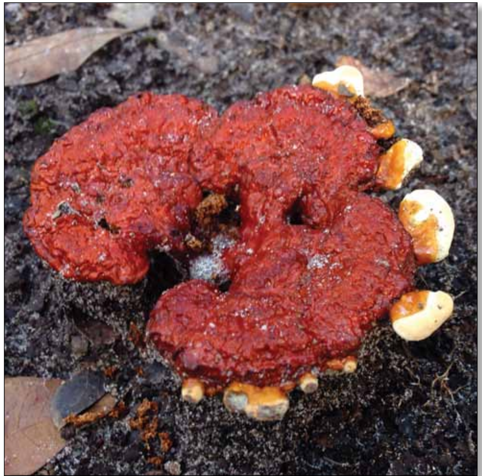
Figure 4. Ganoderma with re-growth at the edges of the pileus found in Georgia after flooding covered the original fruiting body.