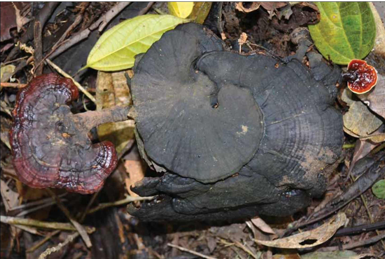
Figure 6. A Ganoderma found in the Ecuadoran Amazon at the Limoncocha Biological Reserve producing two new fruiting bodies at the edge of an older (black) basidiocarp.

the readers of FUNGI magazine out looking, new examples will undoubtedly be found and maybe mushroom growers producing Ganoderma will be inspired to someday cultivate a finely crafted version of a fingered Ganoderma necklace or a really creepy evil demon hand to rival the old ones recorded in the mycological historic record. We eagerly wait for such an event.