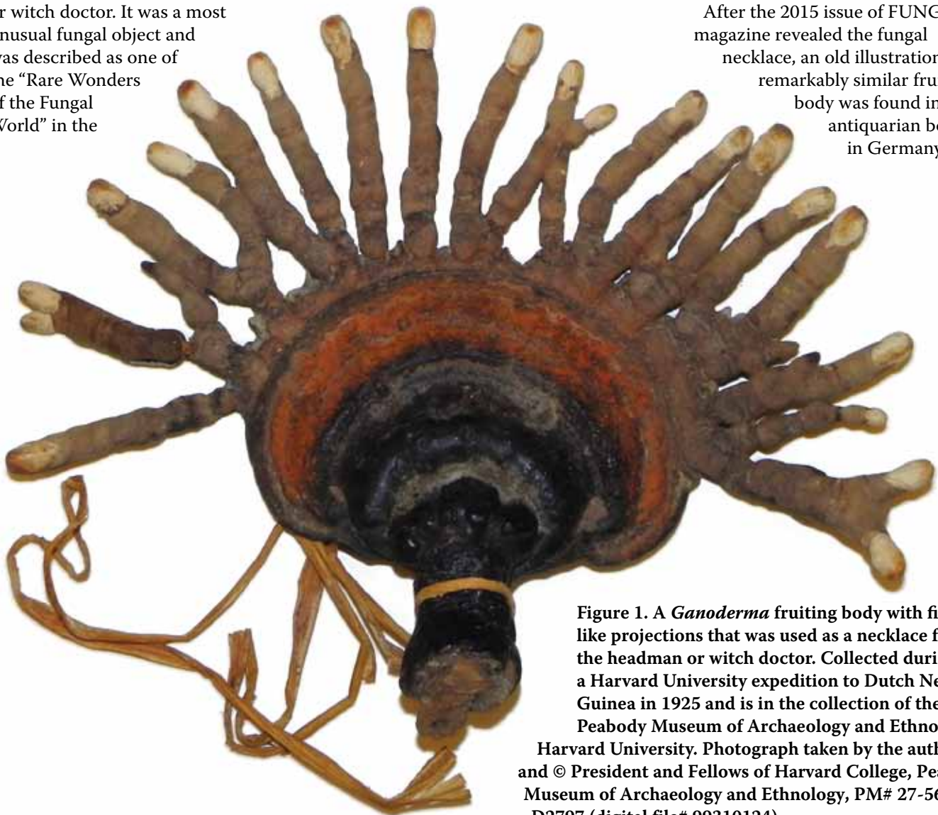
Figure 1. A Ganoderma fruiting body with finger-like projections that was used as a necklace for the headman or witch doctor. Collected during a Harvard University expedition to Dutch New Guinea in 1925 and is in the collection of the Peabody Museum of Archaeology and Ethnology, Harvard University. Photograph taken by the author and © President and Fellows of Harvard College, Peabody Museum of Archaeology and Ethnology, PM# 27-56-70/D2797 (digital file# 99310124).

After the 2015 issue of FUNGI magazine revealed the fungal necklace, an old illustration of a remarkably similar fruiting body was found in an antiquarian bookshop in Germany called