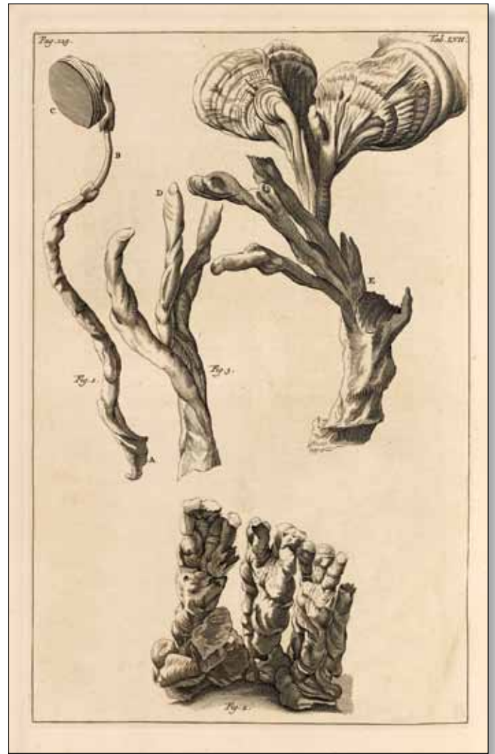
Figure 2. Illustration from an 1826 article by the Nees von Esenbeck brothers where they described a new species, Polyporus pisachapani . This Ganoderma with monstrous re-growths resembling fingers was drawn life size (30 inches in length). The species name pisachapani translates to “hand of the evil demon”. The illustration, a foldout in the publication, was digitally manipulated to remove the folds and age spots that occurred on the original drawing.